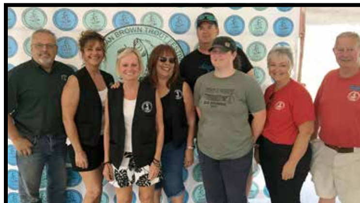
Michigan Brown Trout Festival Executive Committee